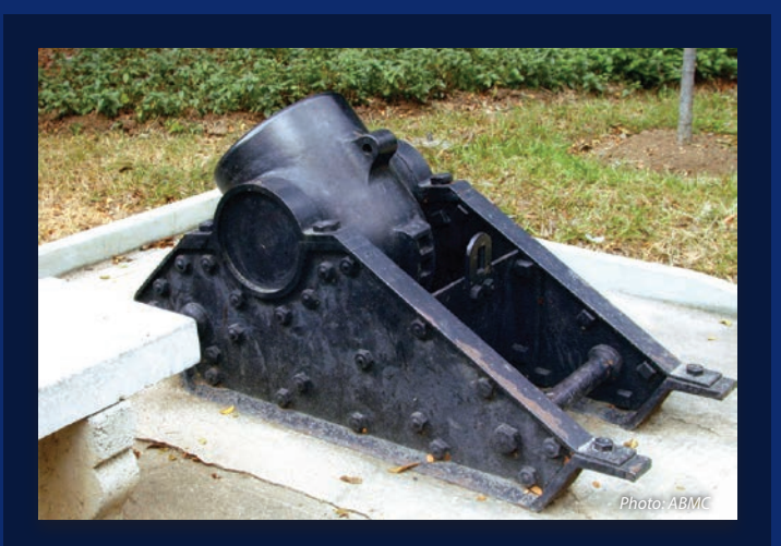
One of the four siege mortars (Model 1861) emplaced around the Memorial, along with four Spanish cannons.