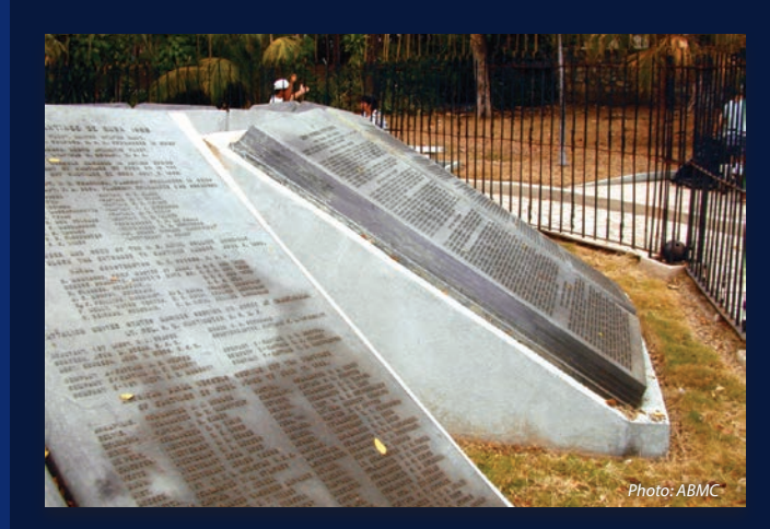
Eight bronze tablets (each 3 feet X 5 feet) honor and commemorate individuals and units participating in the Santiago Campaign.

cover photo: The brochure cover is a 1957 photo of the Surrender Tree within the memorial, showing it retained its distinctive shape.