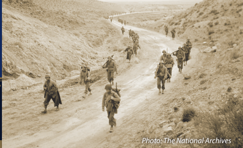
1st Infantry Division soldiers advance through Kasserine Pass, Feb. 26, 1943.