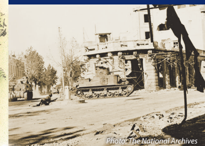
U.S. infantry and tanks clear Bizerte of enemy snipers.

The figure called "Honor" bestows a laurel wreath upon those who gave their lives. Inscription on the pedestal proclaims, "honor to them that trod the path of honor."