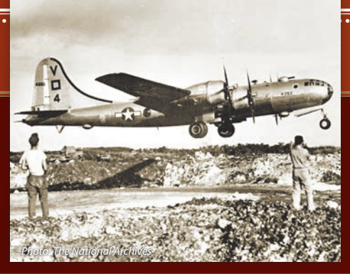
November 23, 1944. A B-29 Superfortress takes off from Isely Field on Saipan for the first bombing mission to Tokyo.

bombing range of the Japanese home islands. Operation FORAGER was conducted to capture those locations.