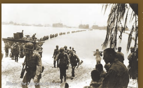
June 17, 1944. Soldiers of the Army's 27th Infantry Division wade ashore to reinforce the Marines on Saipan.