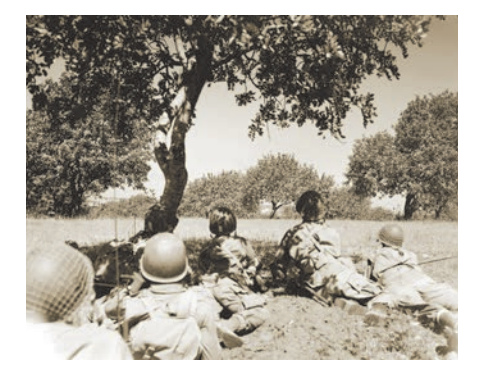
82nd Airborne Division paratroopers at Biazza Ridge, Sicily, the second day after their night jump on July 9, 1943.

A preliminary air campaign secured air superiority for the Allies. On July 10, 1943 the U.S. Navy landed the Seventh Army with three reinforced divisions around Gela on Sicily's southern coast. The night before, Army Air Forces troop carrier wings dropped paratroopers of the 82nd Airborne to seize advanced positions and