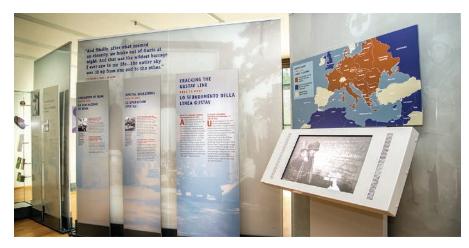
Interactive touchscreen kiosk stations enable visitors to explore the details of the several campaigns represented here.

Restrooms are conveniently located in the visitor center.