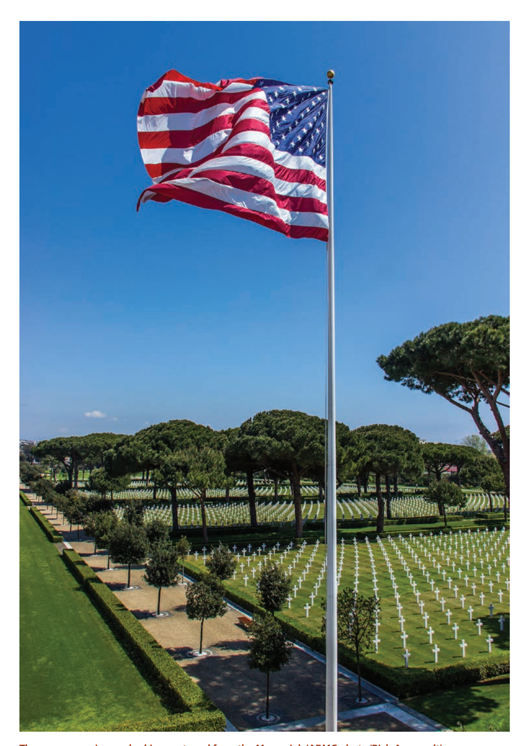
The graves area is seen looking eastward from the Memorial.