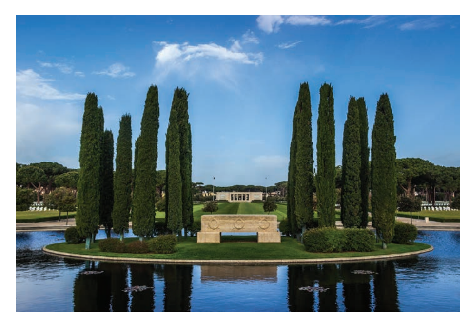
The reflecting pool with cenotaph.

The cemetery sits in the zone of advance of the U.S. 3rd Infantry Division during the Anzio-Nettuno campaign beginning in January 1944. A temporary wartime cemetery was established here on January 24, 1944, two days after the units of the VI Corps landed on the beaches nearby.