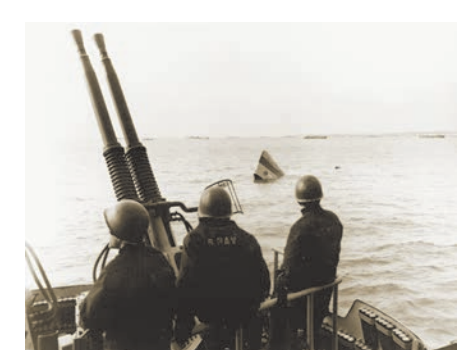
Sailors at a 40 mm antiaircraft gun mount aboard USS Brooklyn (CL-40) observe USS Portent (AM-106) sinking off Anzio after hitting a mine on D-Day, January 22, 1944.

As the Naples-Foggia Campaign ground to a halt, the Allies faced the formidable defenses of the Gustav Line. They resolved to outflank this line with an amphibious landing. American and British forces landed ashore near Anzio and Nettuno on January 22, 1944. The landings were virtually unopposed at first, and reinforcements were landed.