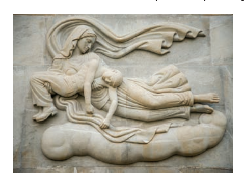
"Resurrection" panel.

The map room is entered through bronze gates. An octagonal table inset with a circular relief map of Italy occupies the center of the room. The map is of bronze, inset with marble mosaic tile in various shades of blue depicting the sea areas. It was fabricated by Bruno Bearzi from information supplied by ABMC. It shows in general outline the American military operations in Sicily and Italy during the period 1943-45.