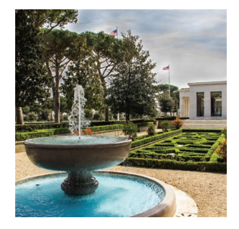
The granite fountain in the North Garden