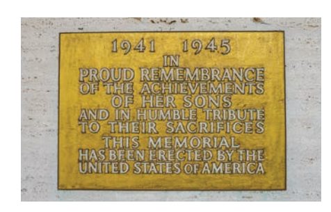
"The Dedication Tablet"