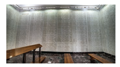
Brigadier General Charles L. Keerans, Jr. is the highest –ranking among the 3,095 individuals whose names and information are inscribed here.