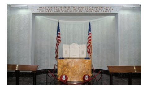
The altar, flanked by Tablets of the Missing.