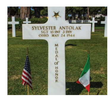
Sylvester Antolak's headstone.