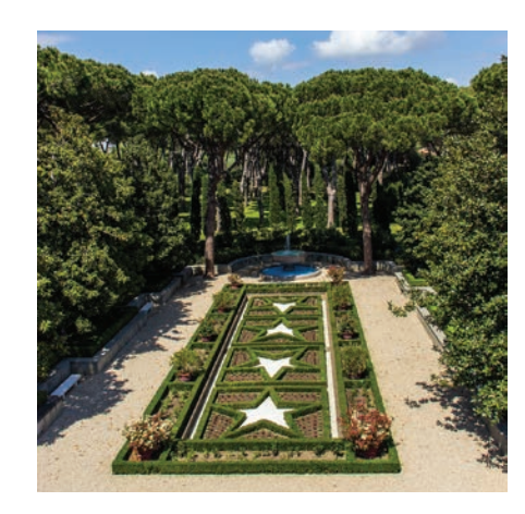
The North Garden.

At the far end of the garden is a Baveno granite fountain consisting of a large-semi-circular bowl on a wide pedestal. It was carved from a single piece of granite quarried near the north end of Lake Maggiore. Cascades of water flow from the bowl into a low basin.