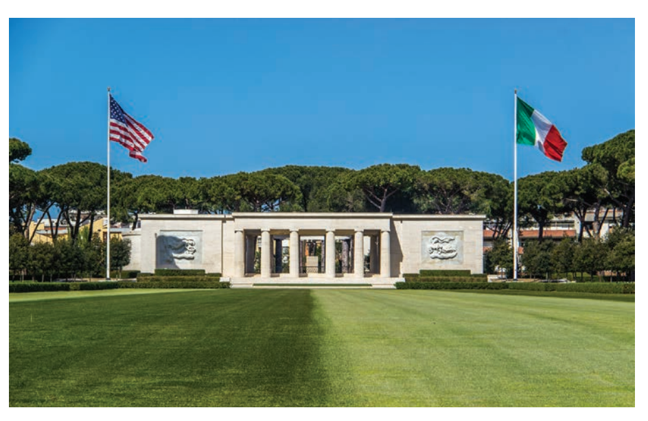
The memorial viewed from the east.