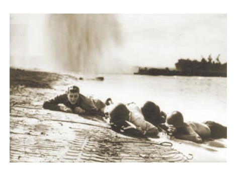
U.S. Coast Guardsmen and Navy beach battalion men hug the shaking beach south of Salerno as a Nazi bomber unloads on them. September 1943.

The Germans and Italians decided to withdraw from Sicily. Fighting a skillful delaying action, they evacuated 100,000 troops from the island during August 3-16. These included three German mechanized divisions, their best and most mobile forces. Less mobile infantry and coastal defense units generally surrendered. The American 3rd Infantry Division entered Messina on the night of August 16.