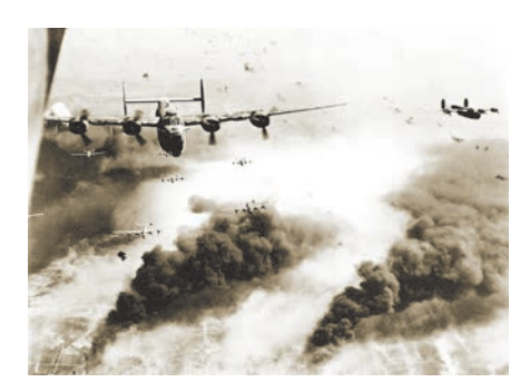
Fifteenth Air Force B-24 Liberator bombers fly over the Concordia Vega Oil refinery in Ploesti, Romania, after dropping their bomb loads on the oil cracking plant. May 31, 1944.

The 332nd Fighter Group deployed to Italy in February 1944, flying P-51 Mustang fighter airplanes. It was tasked with escorting Fifteenth Air Force heavy strategic bombers. The group became known as the "Red Tails" because of the crimson unit identification on the tail of their aircraft.