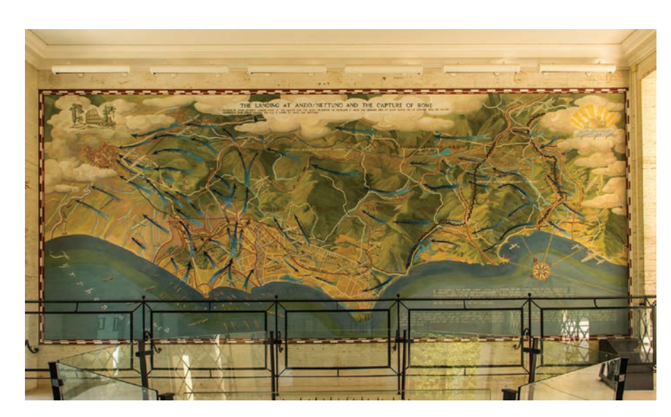
The map on the east wall is named "The Landing at Anzio/Nettuno and the Capture of Rome."

On the west wall are three maps – "The Capture of Sicily," "The Strategic Air Assaults" and "The Naples-Foggia Campaign." To aid in understanding them, the maps bear explanatory inscriptions. Beneath the maps are two sets of key maps, "The War Against Germany" and "The War Against Japan."