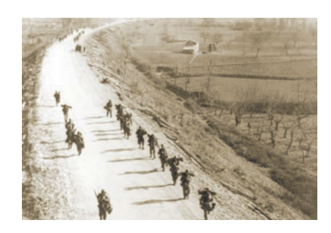
Two columns of U.S. soldiers march northward along Italy's highway 6—the famous "Road to Rome"—at a position south of Cassino, January 31, 1944.