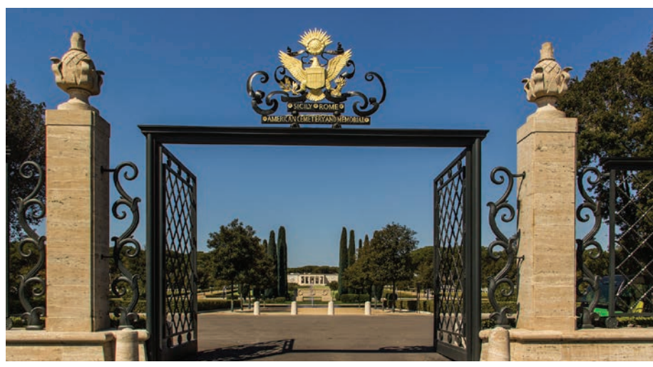
The U.S. seal surmounts the cemetery's entry gates. Immediately inside to the right are the visitor building and the visitor center.

THEY DIED THERE VALIANTLY AND HEROICALLY, GIVING THEIR LIVES THAT PEOPLES OF EUROPE MIGHT BE LIBERATED FROM TYRANNY. ... THEY REST TRANQUIL AND SECURE IN THE FRIENDLY SOIL OF ITALY. MAY OUR GREAT DEBT TO THEM, AND ALL OTHERS WHO DIED IN THE CAUSE OF FREEDOM, SERVE AS AN INSPIRATION TO ALL PEOPLES TO DEDICATE THEMSELVES TO FREEDOM AND LASTING PEACE.