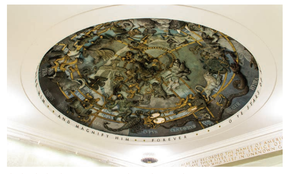
The chapel ceiling dome structure.

O YE STARS OF HEAVEN BLESS YE THE LORD PRAISE HIM AND MAGNIFY HIM FOREVER.