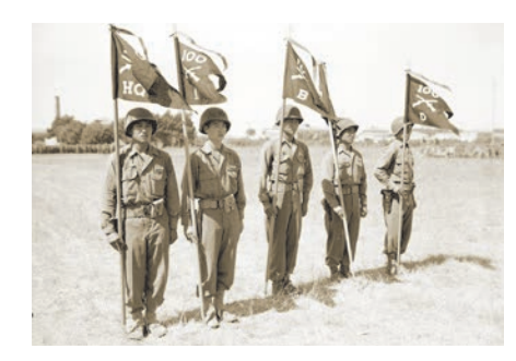
Guidon bearers of the 100th Battalion, 442nd Regimental Combat Team. The Japanese American unit was among those reaching the Arno River area on July 23, 1944.

The Allies broke through the Gustav Line on May 13. They pushed on to link up with the Anzio beachhead and overrun subsequent German defensive lines. On June 4, 1944 American units entered Rome and liberated the first European capital city of the war.