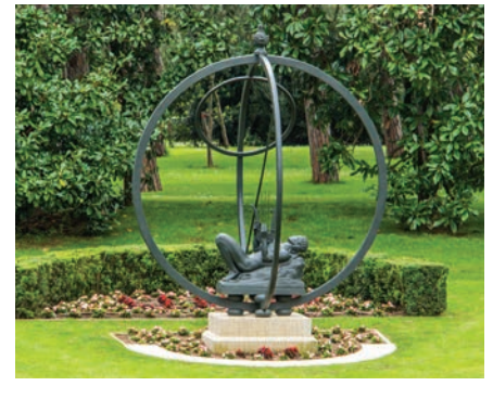
A statue of Orpheus rests on the armillary sphere in the South Garden.

each side with connecting semi-circular planters containing beds of annual flowers. Golden raintrees and pink crepe myrtle border the planters. At the far end of the garden is a bronze statue of the legendary Thracian poet and musician Orpheus circumscribed by an armillary sphere with a sundial.