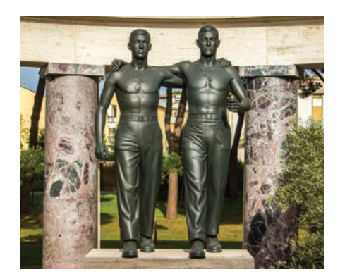
The "Brothers in Arms" sculpture is the central feature of the peristyle.

"The "Brothers In Arms" sculpture represents an American soldier arm in arm with an American sailor. The statue symbolizes the fraternity between the U.S. Army and Navy that was essential to the success of the three amphibious assaults in Italy during World War II. The two servicemembers can be distinguished via small differences in their identification tags, belt buckles, and trouser pockets. The bronze sculpture is by Paul Manship of New York. It was cast at the Battaglia Foundry in Milan.