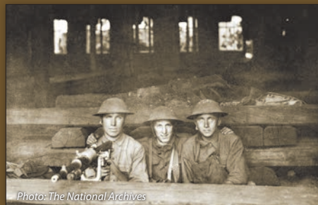
Machine gun crew of the 3d Division stands ready in a railroad shop at Chateau-Thierry.