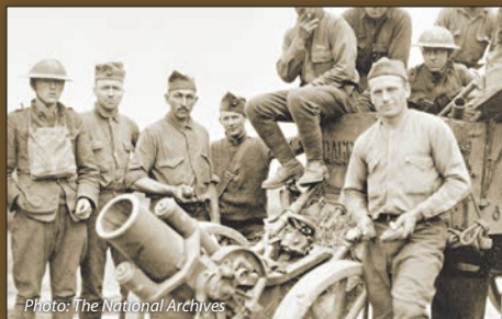
Marines of 2d Battalion, 5th Marine Regiment, with a German trench mortar captured in Belleau Wood.

Two heroic-size figures on the west side depict the unity of the United States and France.