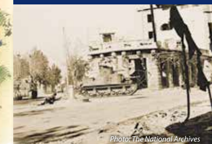
U.S. infantry and tanks clear Bizerte of enemy snipers.