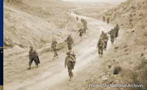
1st Infantry Division soldiers advance through Kasserine Pass, Feb. 26, 1943.