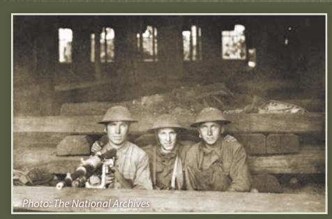
Machine gun crew of the 3d Division stands ready in a railroad shop at Chateau-Thierry.