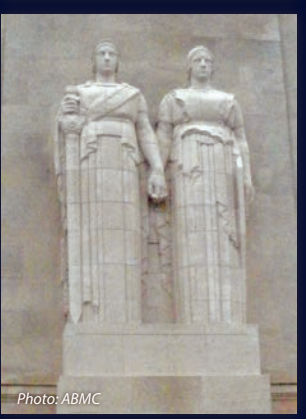
Two heroic-size figures on the west side depict the unity of the United States and France.