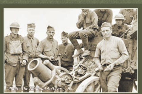
Marines of 2d Battalion, 5th Marine Regiment, with a German trench mortar captured in Belleau Wood.