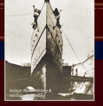
Destroyer USS Decatur (DD-5) undergoes repairs at the drydock in Gibraltar. She performed patrol and convoy duties from October 20, 1917 to December 8, 1918.

The United States entered World War I on April 6, 1917. The American Expeditionary Forces (AEF) bound for combat in Europe relied upon sea transport. German submarines posed a major threat to the traffic. General John J. Pershing,