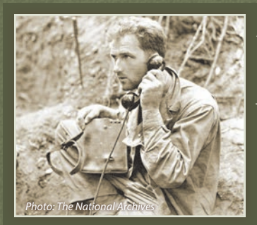
A 25th Infantry Division soldier holds a telephone struck by fragments from a Japanese mortar. He was unhurt, and the phone worked. Guadalcanal, January 10, 1943.

The interservice cooperation that worked well on Guadalcanal continued throughout the war in the Pacific.