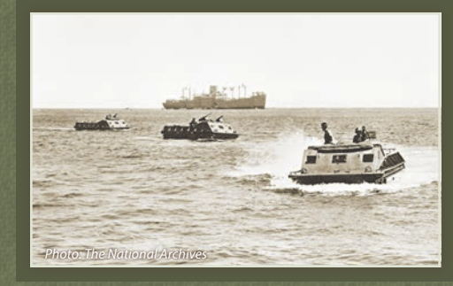
Amphibious tractors unloaded from Navy transports head to the beach at Guadalcanal, August 1942.