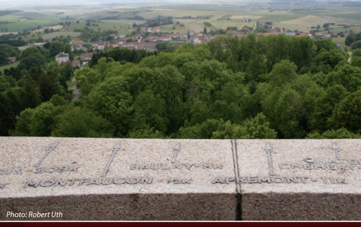
The observation platform on top of the Montfaucon Monument is reached by 234 steps. It affords magnificent views of this battlefield and the countryside.

SEPTEMBER 26, 1918: U.S. First Army launched the offensive. Montfaucon was the immediate objective of V Corps. Advances were achieved on both flanks of Montfaucon, but the fortified hill remained in German hands.