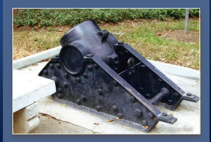
One of the four siege mortars (Model 1861) emplaced around the Memorial, along with four Spanish cannons.

cover photo: The brochure cover is a 1957 photo of the Surrender Tree within the memorial, showing it retained its distinctive shape.