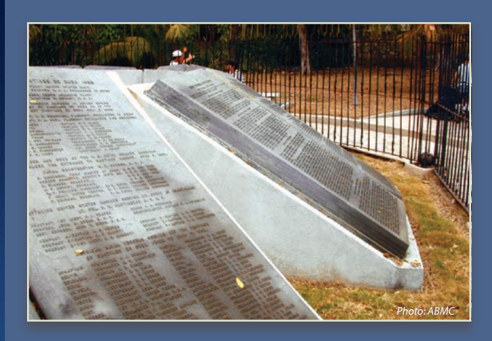
Eight bronze tablets (each 3 feet X 5 feet) honor and commemorate individuals and units participating in the Santiago Campaign.

The Santiago Surrender Tree Memorial was dedicated in mid February 1906. By an Act of Congress, it became the responsibility of ABMC on July 1, 1958.