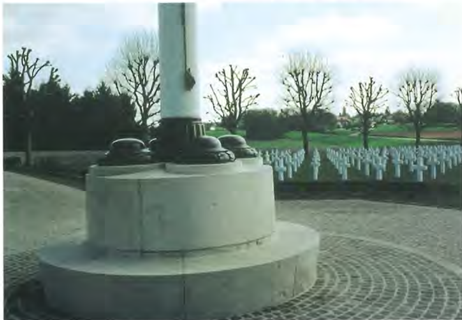
Flag Pole Base with Trench Helmets

The British attack at Cambrai, the first massed tank offensive in history, began on 20 November 1917