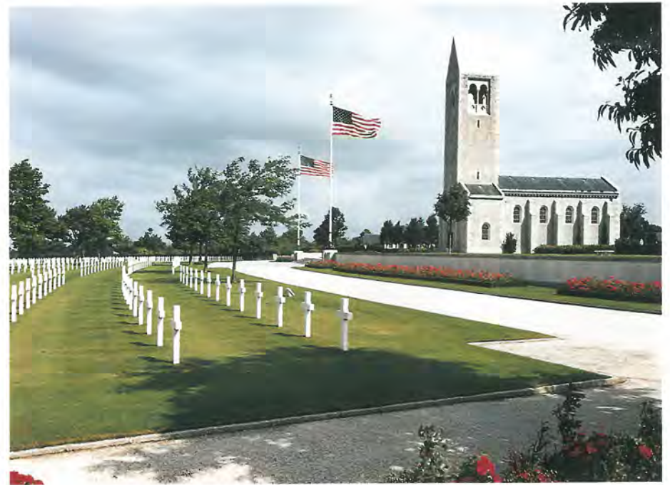
Brittany American Cemetery, St. James, Manche, France

Each grave in the overseas cemeteries is marked by a headstone of white marble — a Star of David for