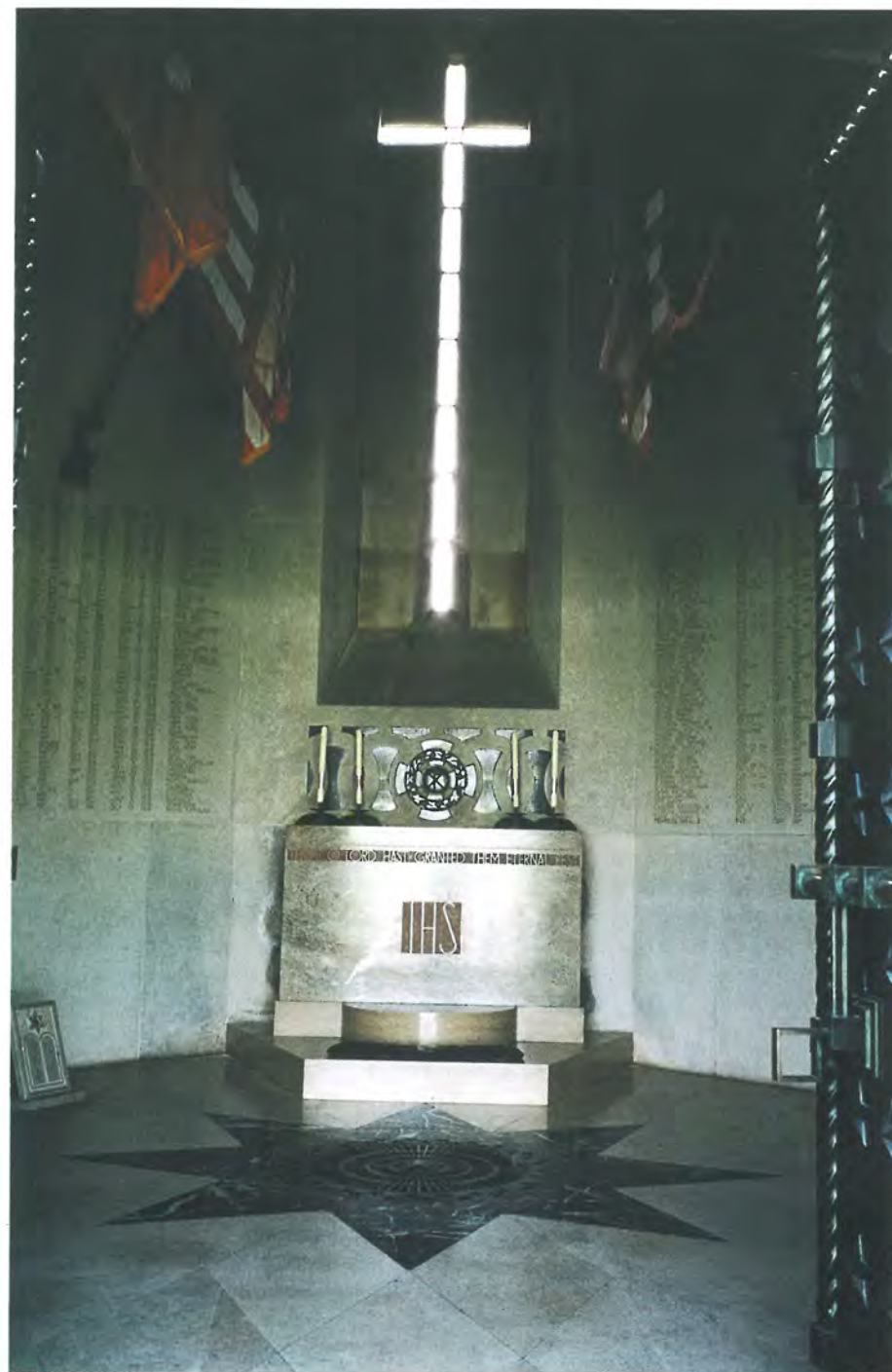
View of Chapel through Entrance Door

Located in the rear of the graves area in Plots C and D are two pillars containing a carillon presented and dedicated on 2 June 1996 by the