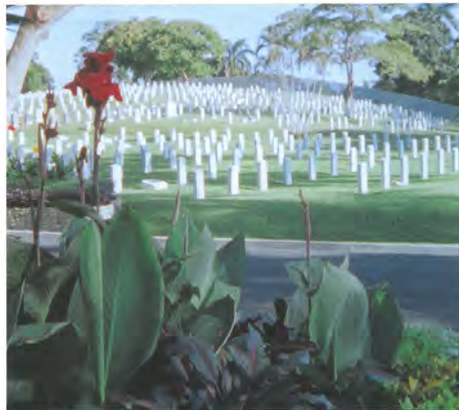
Corozal American Cemetery, Corozal, Republic of Panama