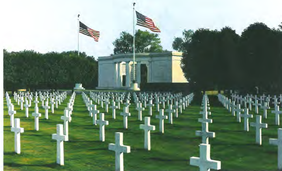
St. Mihiel American Cemetery, Thiaucourt, France