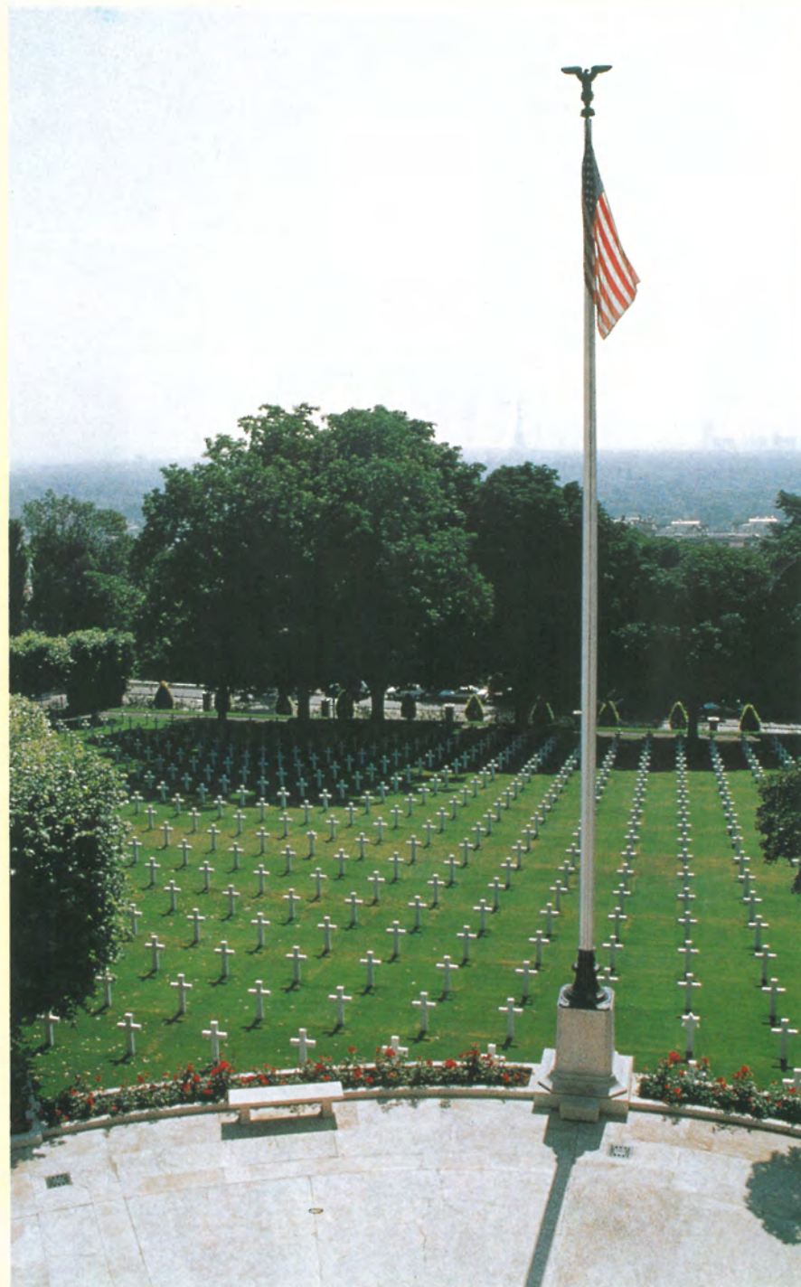
Suresnes American Cemetery and Memorial, Seine, France