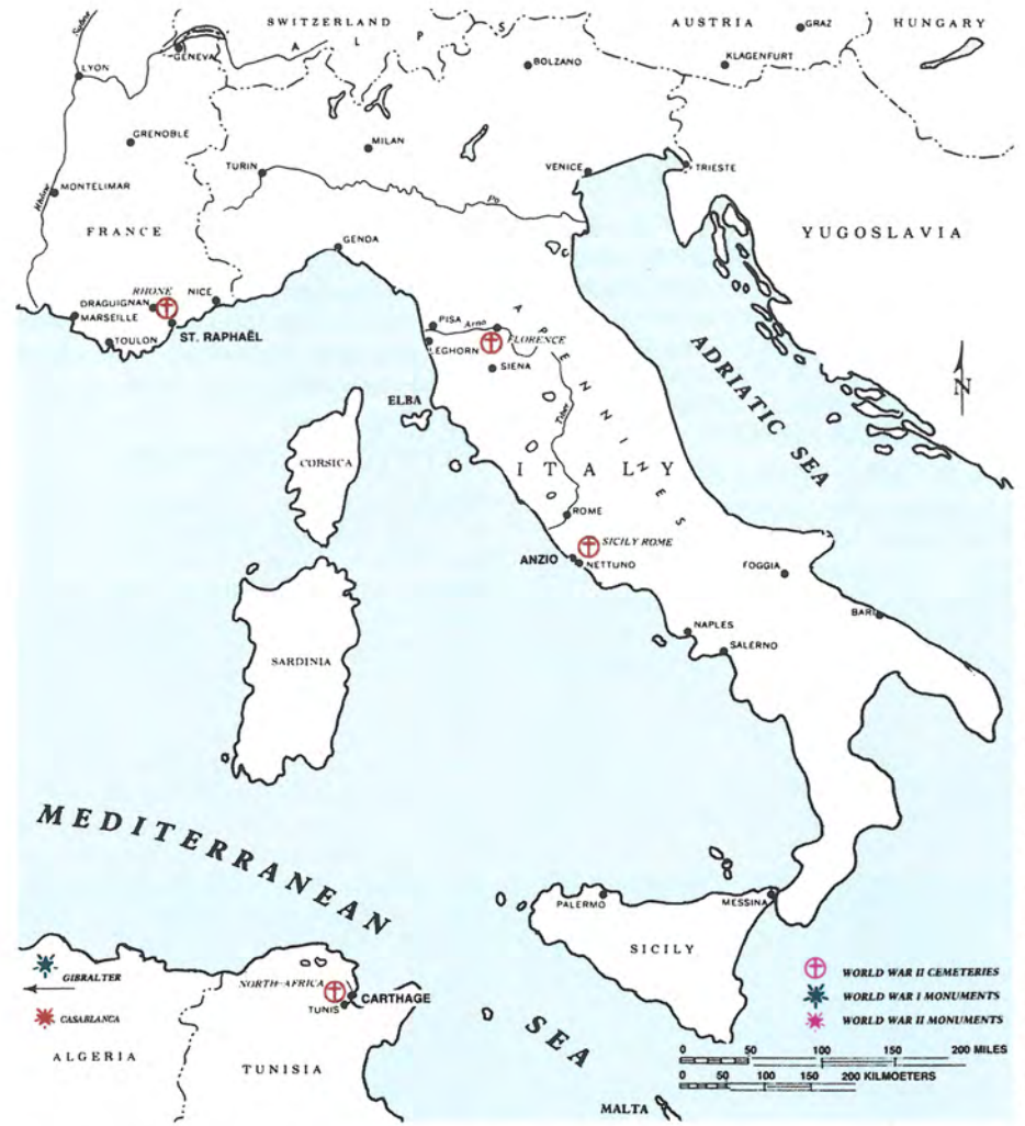
Meuse-Argonne American Cemetery, Romagne, Meuse, France

Cotentin Peninsula from 6 June to 1 July 1944. It consists of a red granite obelisk surrounded by a small, developed park overlooking the historic sand dunes of Utah Beach, one of the two American landing beaches during the Normandy Invasion of 6 June 1944.