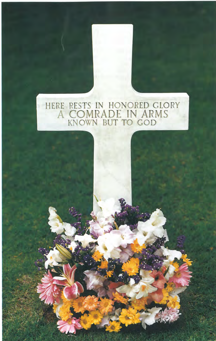
Decorated Gravesite of a World War II "Unknown"