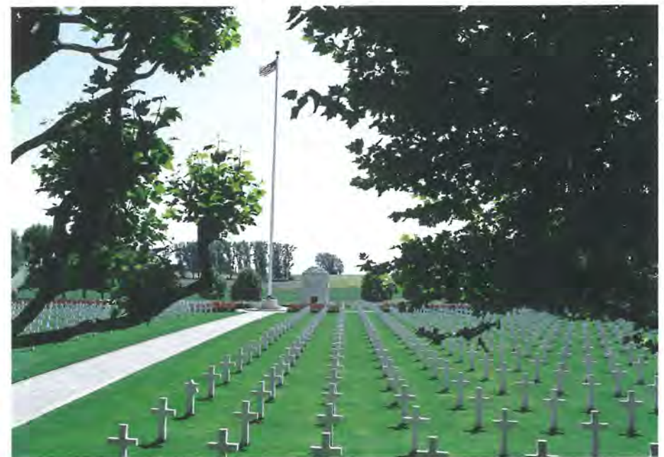
View of Graves Area

On 6 October, after having been temporarily relieved from the front,