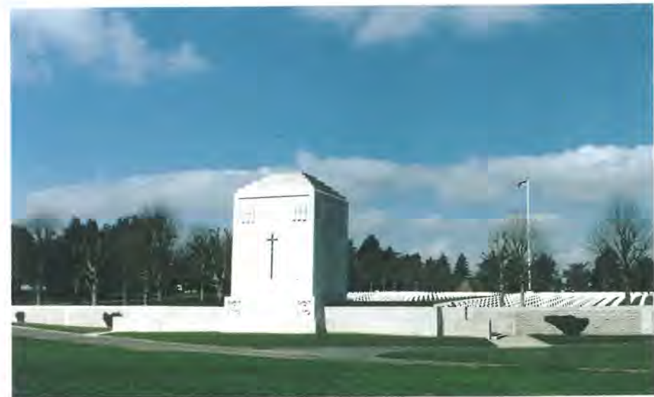
Memorial Chapel and Graves Area from the Rear

The lane leading from the entrance gate to the Visitors' Building is shaded by Linden trees. Plantings of colorful polyantha roses border the grave plots in the area surrounding the flagpole. The meadow areas are landscaped with massifs of multicolored shrubs such as lilac, ash, beech, cedar, elm, holly, ewe, spruce, sycamore and pines.