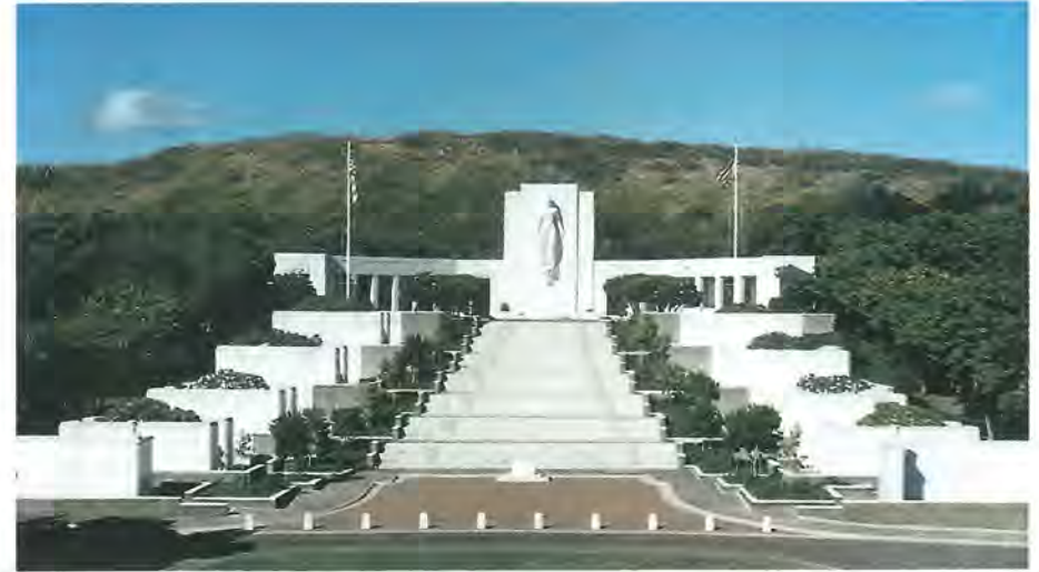
Honolulu Memorial (WW II, Korea and Vietnam), National Memorial Cemetery of the Pacific, Honolulu, Hawaii

CABANATUAN MEMORIAL is located 85 miles north of Manila, approximately 5 miles south of the city of Cabanatuan, Luzon, Republic of the Philippines. It marks the site of the