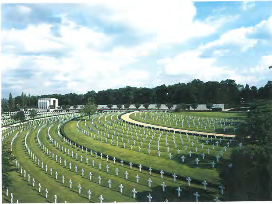
Cambridge American Cemetery and Memorial, Cambridge, England

unfortunately had all too often been found to be poorly designed, poorly constructed and lacking provision for maintenance) was expressly forbidden by the military services. The permanent graphic record takes the form of military maps, usually large murals, amplified by descriptive texts in English as well as in the language of the country in which the cemetery is located. The historical data for these maps were prepared by the American Battle Monuments Commission. The maps themselves were rendered by experienced artists in tasteful presentation using various media: layered marbles, fresco, bronze relief, mosaic concrete or ceramics. Another feature of interest at each memorial is the two sets of "key-maps": "The War Against Germany" and "The War Against Japan." Each set consists of three maps, each covering about one-third of the period of our participation in the war. By these key-