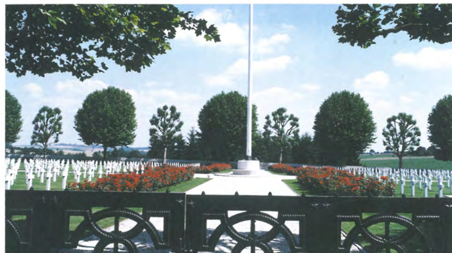
Graves Area from Bronze Gate

Hotel accommodations are available at Peronne, St. Quentin and Cambrai.