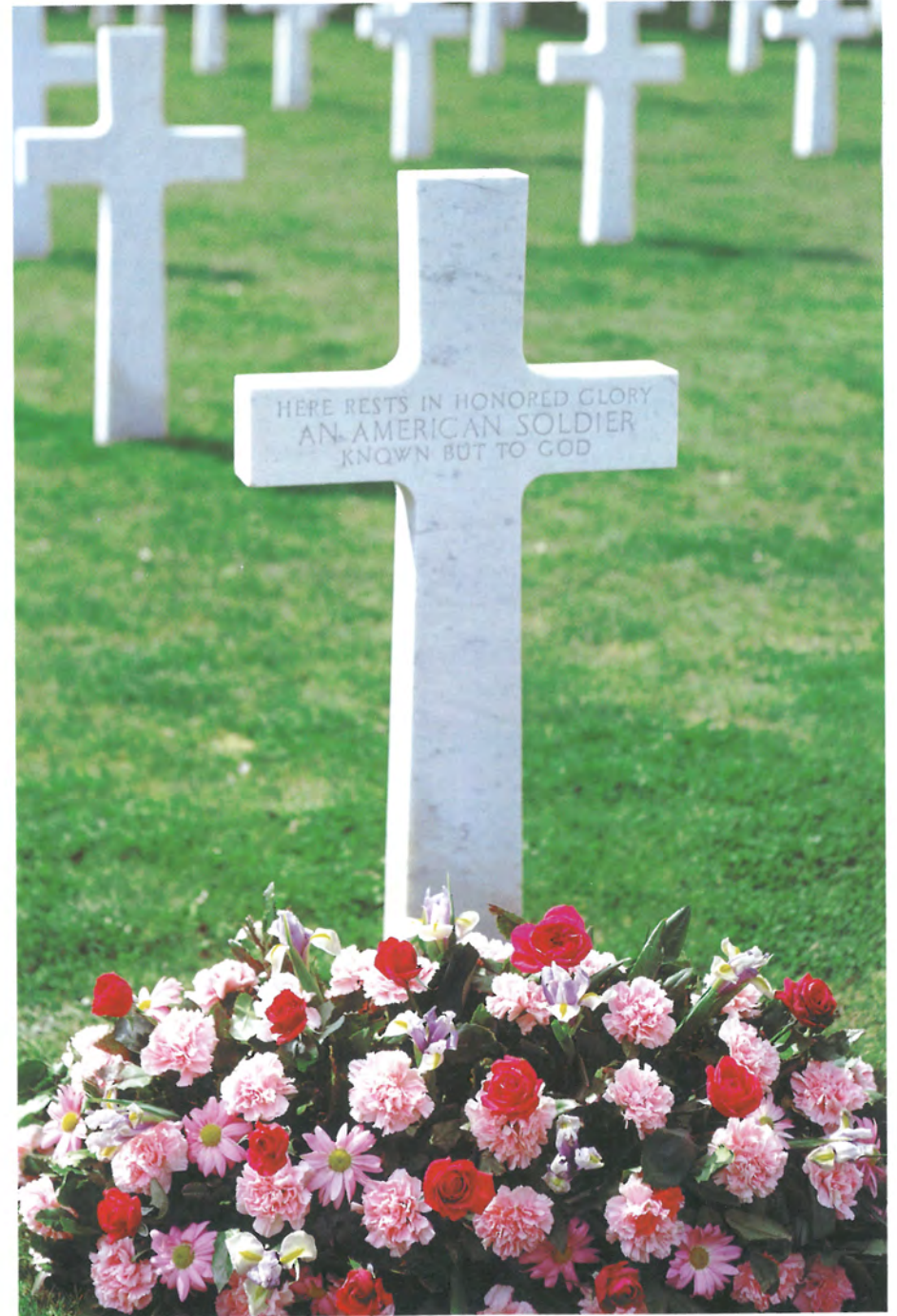
Gravesite of World War I Unknown Soldier