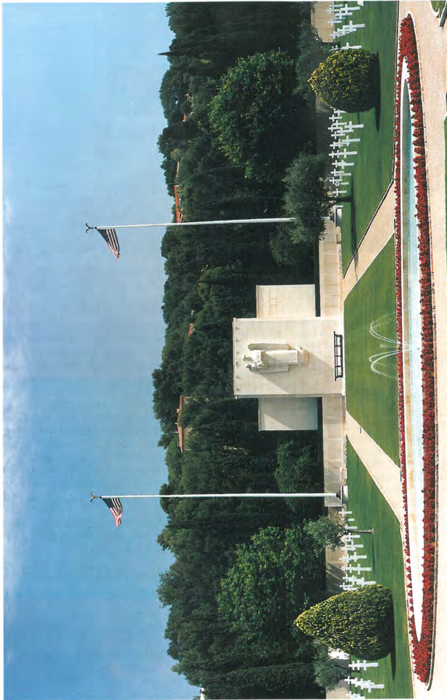
Rhone American Cemetery and Memorial, Draguignan, Var, France