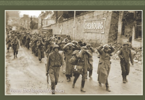
Cherbourg, June 28, 1944. U.S. soldiers led by a captain (front left) escort German prisoners of war out of the city on the day after its liberation.