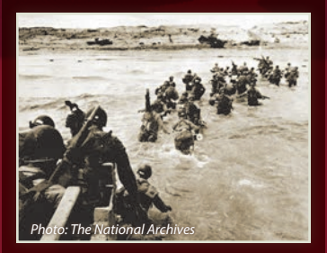
American soldiers plunge into the surf and wade to Utah Beach, June 6, 1944.

German defenses included multiple obstacles along the beaches, plus infantry and artillery capable of blocking exits inland. The Germans also reinforced their units