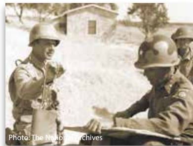
Maj. Gen. Matthew B. Ridgeway (left) confers with Brig. Gen. Maxwell D. Taylor on the battlefield in Sicily on July 26, 1943.